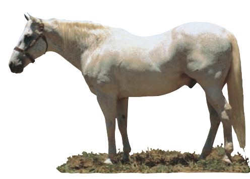
NO MARKINGS: (An advanced stage of the graying effect, often called flea bitten gray.)