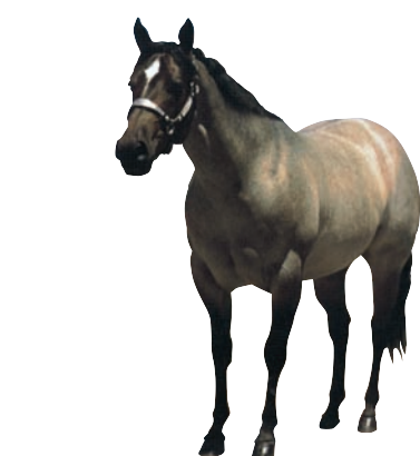
MARKINGS: Star and strip. (Note: Roaning is primarily on body while head and legs have remained dark.)

Bay Roan: More or less uniform mixture of white with red hairs on a large portion of the body; darker on head, usually red but can have a few black hairs in mixture; black mane and tail and black on lower legs.