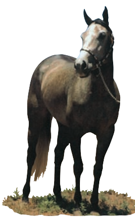
NO MARKINGS: (A relatively young horse with the graying effect most predominant on its head - note that on roan horses head and lower legs remain dark though body is roaned.)