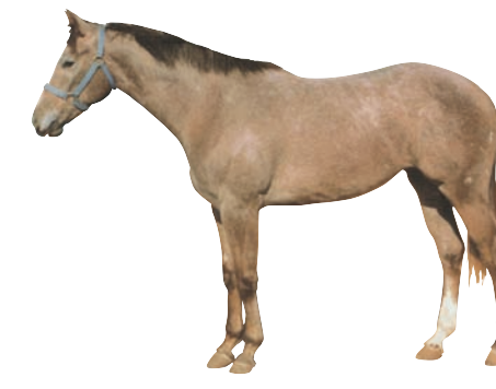
MARKINGS: Right hind stocking. Dark spots on right hind coronet. (Note that in this horse, the gray characteristic is superimposed over a basic sorrel or chestnut color, making this a gray horse. It is a common characteristic of gray horses to have patches of concentrated white hair which are not objectionable providing there is dark skin underlying the patches.)