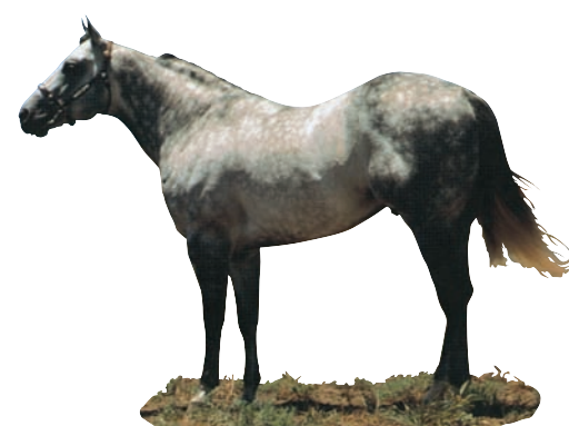
MARKINGS: Left fore half pastern white. (An intermediate stage of the graying effect. This commonly would be called a dappled gray.)

Palomino: Body color a golden yellow; mane and tail white. Palominos typically do not have dorsal stripes.