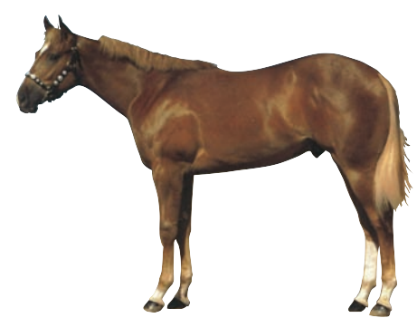
MARKINGS: Star, strip and snip. Left fore half pastern white. Right hind stocking. Left hind pastern white. (Note: This horse's flaxen tail is often found with the sorrel color.)

Following are examples of markings and 17 colors recognized by the American Quarter Horse Association. Notice that there may be extreme variations within a color category.