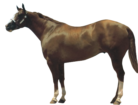
MARKINGS: Blaze. White on lower lip and chin. Socks on fore feet. Left hind stocking.

Sorrel: Body color reddish or copper-red; mane and tail usually same color as body, but may be flaxen; may have dorsal stripe.