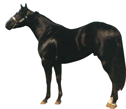
MARKINGS: Star. Left hind half pastern white. Right hind sock.

Black: Body color true black without light areas; mane and tail black.