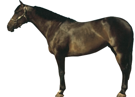
MARKINGS: Right fore pastern white

Brown: Body color brown or black with light areas around muzzle, eyes, flank and inside upper legs; mane, tail and points black.