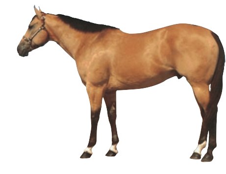
MARKINGS: Fore pasterns white. Right hind sock.

Buckskin: Body color yellowish or gold; mane and tail black; usually black on lower legs. Buckskins typically do not have dorsal stripes.