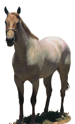
NO MARKINGS. (Note: Head and lower legs have remained dark while roaning is primarily on body.)

Bay Roan: More or less uniform mixture of white with red hairs on a large portion of the body; darker on head, usually red but can have a few black hairs in mixture; black mane and tail and black on lower legs.