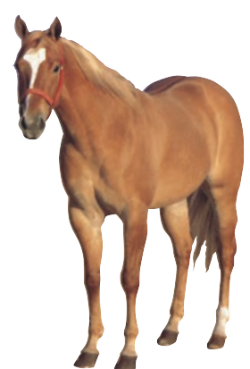
MARKINGS: Star and strip. Left hind sock.

Red Dun: A form of dun with body color yellowish or flesh colored, mane and tail are red or reddish, flaxen, white or mixed; has red or reddish dorsal stripe and usually red or reddish zebra stripes on legs and transverse stripe over withers.