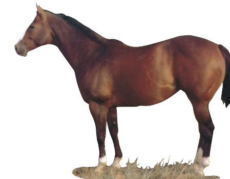
MARKINGS: Blaze. Socks on all feet.

Black: Body color true black without light areas; mane and tail black.