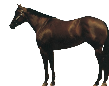
MARKINGS: Left hind coronet white.

Bay: Body color ranging from tan, through red, to reddish-brown; mane and tail black; black on lower legs; may have dorsal stripe.